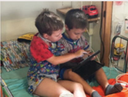
Activities and participants from Camp INSPIRE 2018.